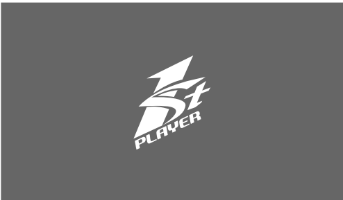
PC GAMING CASE Mi8